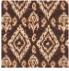
L5036_MINOR QUE_B72_B57 _FE