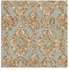
L5036_MINOR QUE_B30_B28 _FE