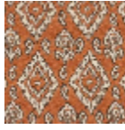
L5036_MINOR QUE_N3013_N 3002_FE