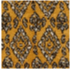
L5036_MINOR QUE_C515_C50 8_FE