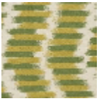
L5037_DUCHE SSE_B23_B76_ FE