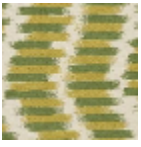
L5037_DUCHE SSE_B23_B76_ FE