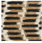
L5037_DUCHE SSE_C508_C51 3_FE