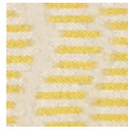
L5037_DUCHE SSE_N3006_N 3010_FE