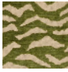
L5038_BENGA LE_C539_C541_ FG_VERSO