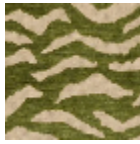
L5038_BENGA LE_C539_C541_ FG_VERSO