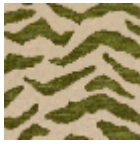
L5038_BENGA LE_C539_C541_ FG