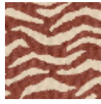
L5038_BENGA LE_N3179_FE_ VERSO