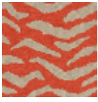
L5038_BENGA LE_B92_FM_V erso