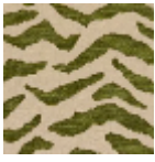
L5038_BENGA LE_C539_C541_ FG