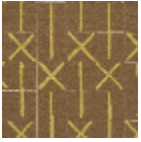
L5039_MAREL LE_B76_B46_F E