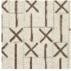
L5039_MAREL LE_C511_N3006 _FM