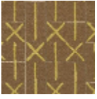
L5039_MAREL LE_B76_B46_F E