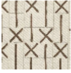
L5039_MAREL LE_C511_N3006 _FM