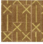
L5039_MAREL LE_N3017_N30 21_FB