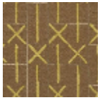
L5039_MAREL LE_B76_B46_F E