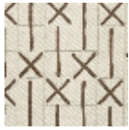
L5039_MAREL LE_C511_N3006 _FM