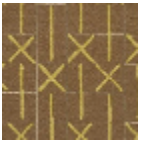
L5039_MAREL LE_B76_B46_F E