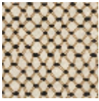
L5040_CANISS E_C508_C513_F E