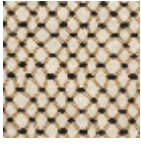
L5040_CANISS E_C508_C513_F E