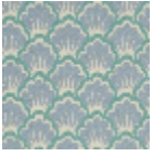
L5043_BOSQU ET_B73_B45_F E