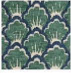
L5043_BOSQU ET_C533_C538 _FE