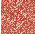
L5045_LES_TU LIPES_N3015_F E