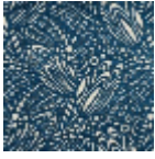
L5045_LES_TU LIPES_C533_F E