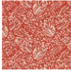
L5045_LES_TU LIPES_N3015_F E