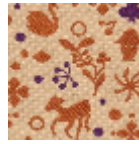
L5046_BRIDG E_N3020_N301 3_FB