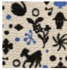
L5046_BRIDG E_C532_C508_ FE