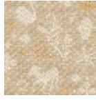
L5046_BRIDG E_N3004_N30 06_FC