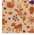
L5046_BRIDG E_N3020_N301 3_FB