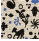
L5046_BRIDG E_C532_C508_ FE