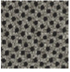
L5048_TOURB ILLONS_B54_F E