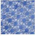
L5048_TOURB ILLONS_C532_ FE