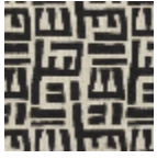
L5049_TSOMB A_B54_FE_Ver so