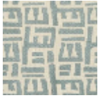
L5049_TSOMB A_N3016_FE_V erso