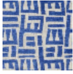
L5049_TSOMB A_C532_FE_Ve rso