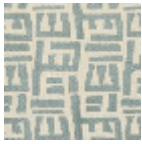
L5049_TSOMB A_N3016_FE_V erso