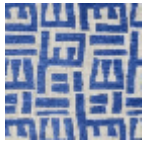
L5049_TSOMB A_C532_FE_Ve rso