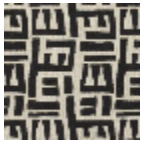
L5049_TSOMB A_B54_FE_Ver so