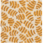
L5052_GNOCC HI_B28_B58_F E