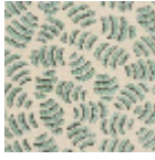
L5052_GNOCC HI_N3137_N313 5_FE