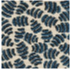
L5052_GNOCC HI_C508_C533 _FE