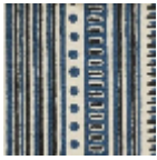
L5053_COCHI NE_C508_C533 _FE