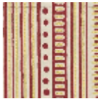
L5053_COCHI NE_N3010_B8 4_FE