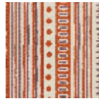
L5053_COCHI NE_N3012_N30 15_FE