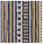
L5053_COCHI NE_B28_B38_F M