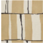
L5056_ZEPPEL IN_N3004_N30 O2_FE