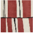
L5056_ZEPPEL IN_C521_C508_ FE