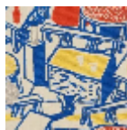
L5062_PETIT_A TELIER_N3019_ N3015_N3010_ N3003_FE