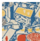
L5062_PETIT_A TELIER_B21_B9 2_B32_B71_FE