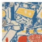
L5062_PETIT_A TELIER_B21_B9 2_B32_B71_FE