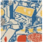
L5062_PETIT_A TELIER_B21_B9 2_B32_B71_FE