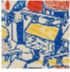
L5062_PETIT_A TELIER_N3019_ N3015_N3010_ N3003_FE