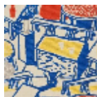
L5062_PETIT_A TELIER_N3019_ N3015_N3010_ N3003_FE