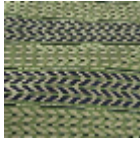
L5065_UBUD_ N3018_N3011_F G