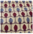
L5070_MENNA _B14_B42_B13_ _FE