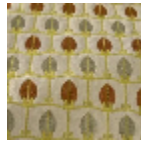
L5070_MENNA _B76_N3013_N 3023_FC