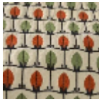
L5070_MENNA _B54_B92_B23 _FE