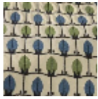
L5070_MENNA _B54_B23_B21_ _FE