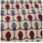
L5070_MENNA _B14_B42_B13_ _FE