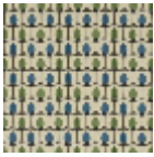
L5070_MENNA _B54_B23_B21_ _FE