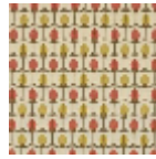
L5070_MENNA _N3021_N3139_ N3104_FE