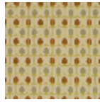
L5070_MENNA _B76_N3013_N 3023_FC