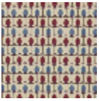
L5070_MENNA _B14_B42_B13_ _FE