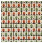
L5070_MENNA _B54_B92_B23 _FE