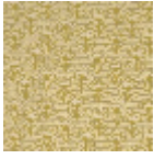
L5071_FLEUR_ DE_COTON_N 3010_N3004_F E