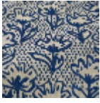
L5071_FLEUR_ DE_COTON_N 3019_FE