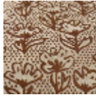
L5071_FLEUR_ DE_COTON_N 3179_FE