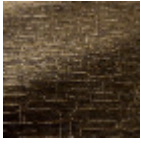
L5072_VOLUT ES_C508_C512_ FB