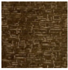
L5072_VOLUT ES_C508_C512_ FB