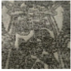
L5076_DRAPE RIES_C544_C5 08_FM