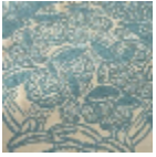
L5076_DRAPE RIES_B73_B37 _FE