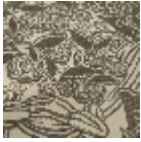
L5076_DRAPE RIES_N3023_N 3002_FE