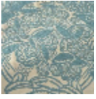
L5076_DRAPE RIES_B73_B37 _FE