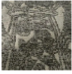
L5076_DRAPE RIES_C544_C5 08_FM