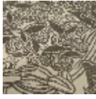
L5076_DRAPE RIES_N3023_N 3002_FE