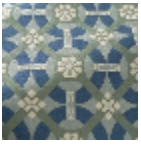
L5077_CASTEL NAU_B31_B21_ B30_FE