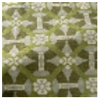
L5077_CASTEL NAU_C539_C5 42_C544_FE