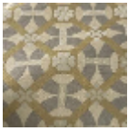
L5077_CASTEL NAU_N3004_N 3003_N3006_F G