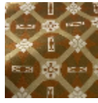
L5077_CASTEL NAU_N3004_N 3021_N3013_FE