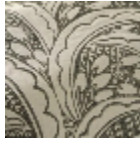
L5078_LES_DA TTES_N3023_N 3002_FE