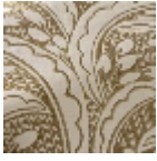
L5078_LES_DA TTES_N3004_ N3021_FE