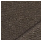
O7939021 Sous bois