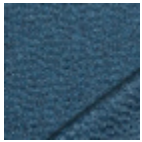
O7939001 Grand large