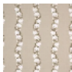
T0086002 Gnton border chanterelle