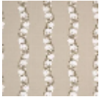
T0086002 Gnton border chanterelle