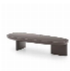
FJIMMTA160LI FJIMMTA160LI 2 FJIMMTA160LI 3 FJIMMTA160LI 4 FJIMMTA160LI 5