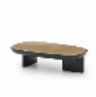
FJIMMTA140L FJIMMTA140L B FJIMMTA140L BI FJIMMTA140L BI2 FJIMMTA140L BI3 FJIMMTA140L BI4 FJIMMTA140L BI5 FJIMMTA140LI FJIMMTA140LI 2