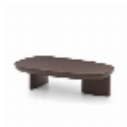
FJIMMTA FJIMMTA140B FJIMMTA140BI FJIMMTA140BI 2 FJIMMTA140BI 3 FJIMMTA140BI 4 FJIMMTA140I2 FJIMMTA140I3 FJIMMTA140I4