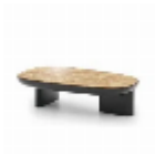
FJIMMTA140LI 3 FJIMMTA140LI 4 FJIMMTA140LI 5 FJIMMTA160B FJIMMTA160BI FJIMMTA160BI 2 FJIMMTA160BI 3 FJIMMTA160BI 4 FJIMMTA160I2