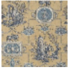
BP207003 Antique blue