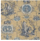
BP207003 Antique blue