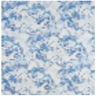
BP343001 Bleu de chine