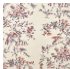
BP349001 Fruits rouges