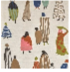
FP155001 MULTICOLOR E