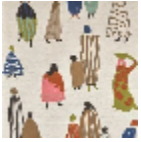
FP155001 MULTICOLOR E