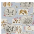
FP193003 Blue surf