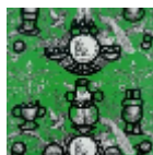
FP568003 Vert printemps