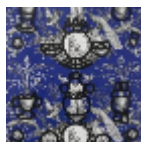
FP568002 Bleu outremer