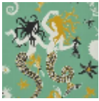
FP771003 MENTHE A L'EAU