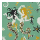
FP771003 MENTHE A L'EAU