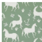
FP776002 Argile verte