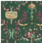
LP101004 Vert empire